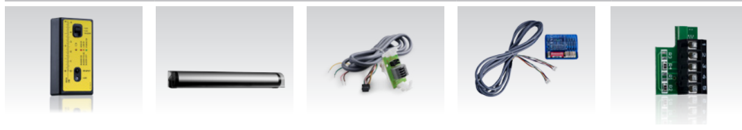
Spotfinder Rain Accessory Fire Door Adapter Multisensor hub Retrofit interface